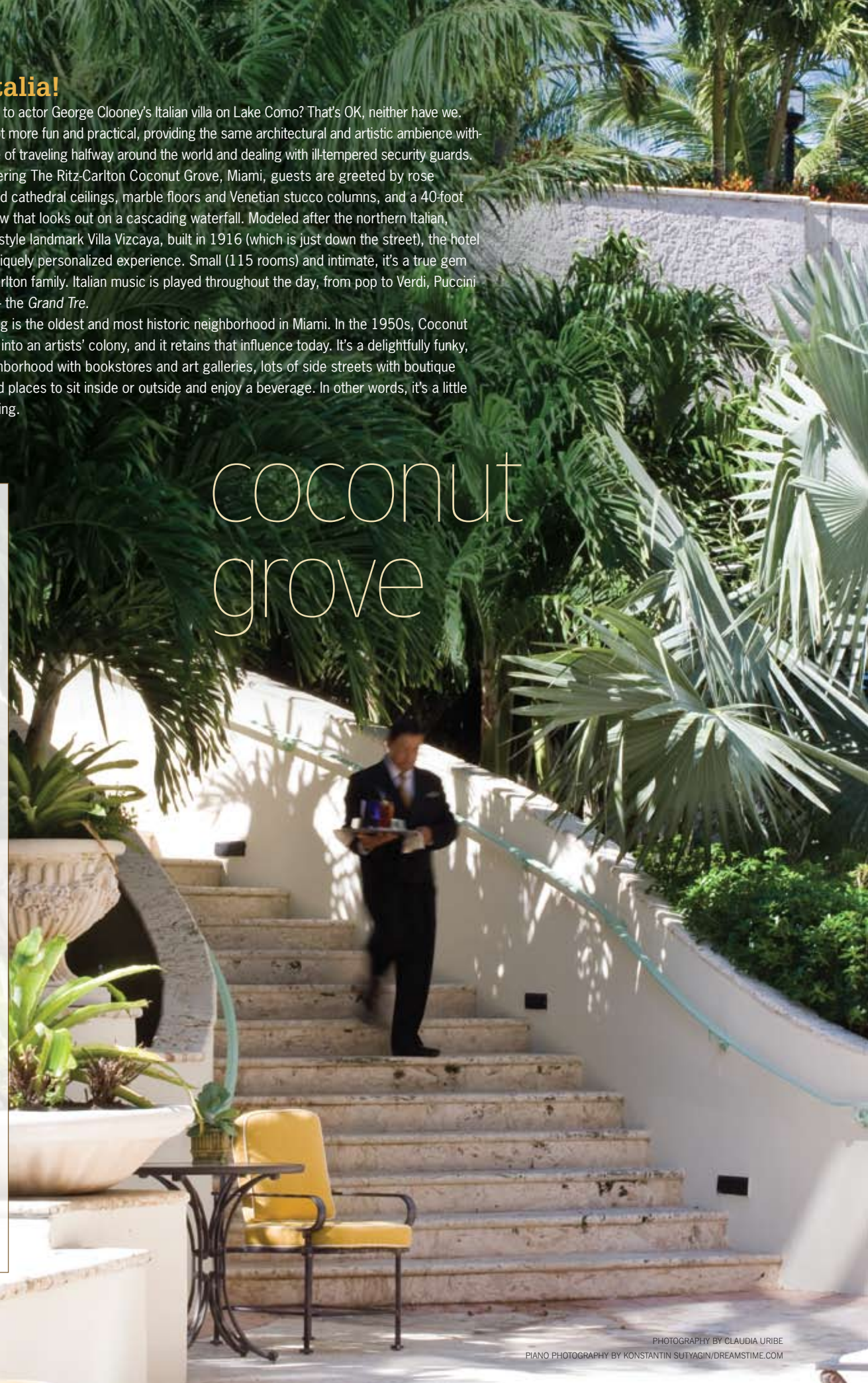
PHOTOGRAPHY BY CLAUDIA URIBE PIANO PHOTOGRAPHY BY KONSTANTIN SUTYAGIN/DREAMSTIME.COM

RECONNECT PACKAGE: Starts at $329 per night. Includes $20 spa credit, breakfast for two at Bizcaya and daily valet parking.