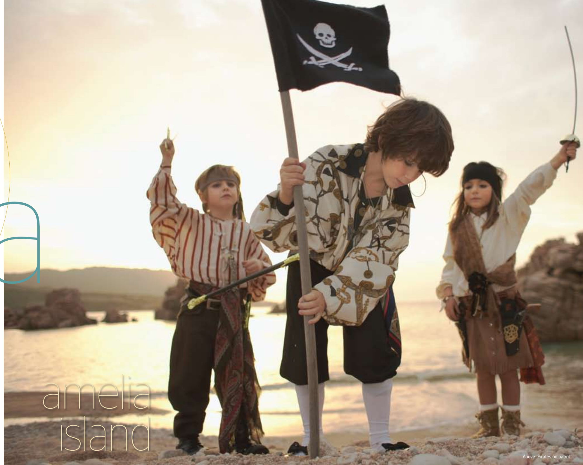
Above: Pirates on patrol